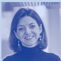
Laurence Boone State Secretary for European and Foreign Affairs, France; CEPR Distinguished Fellow