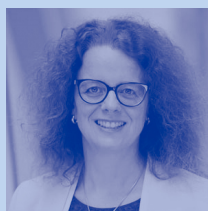
Isabel Schnabel Member of the European Central Bank's Executive Board; Professor, University of Bonn (on leave); CEPR Research Fellow and Distinguished Fellow