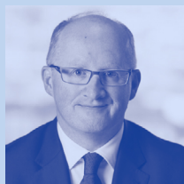
Philip Lane Chief Economist, European Central Bank; Whately Professor of Political Economy, Trinity College Dublin (on leave); CEPR Research Fellow